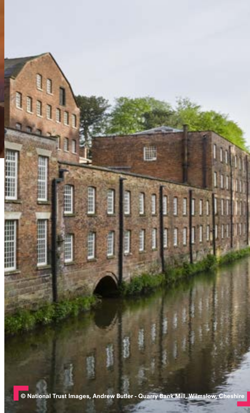
Quarry Bank Mill, Wilmslow, Cheshire