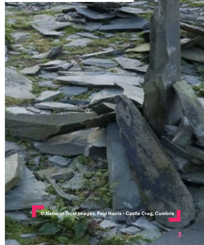
Castle Crag, Cumbria

As part of a Filming Partnership it is vital that local authorities provide Creative England with information about productions in their area. This allows us to ensure that productions are fully serviced and that our statistics accurately reflect filming activity in the English regions. Please see an example of how you can send your filming data to us in Appendix A, and contact your local Creative England representative to discuss how to share this data with us.